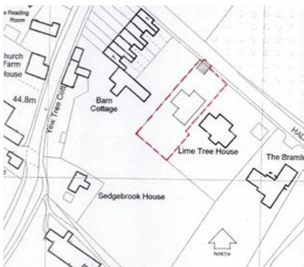
Block Plan Approved under 16/01897/FUL

Diagram A shows a comparison between the block plan approved in 2016 and the currently proposed block plan.