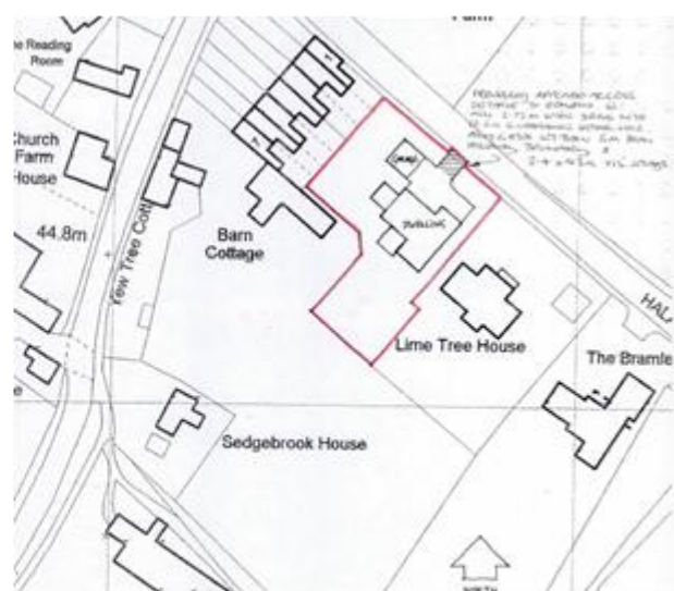
Proposed Block Plan 18/00501/FUL