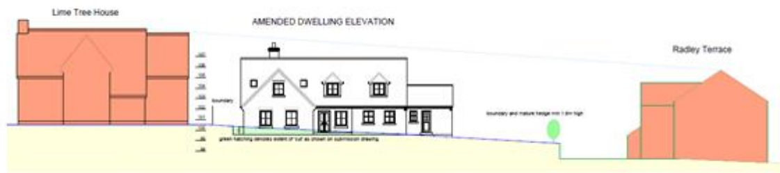
elevation facing Halam Hill (north east ) at 1:100 showing relationship with adjacent property, Lime Tree House and Radley Terrace

ridge level of The Bramley north-east of Lime Tree House